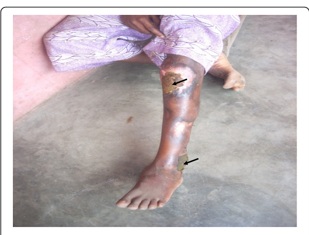
Figure 2 Herbal treatment for ulcers*. *Respondent has had BU for more than 3 years and is being treated at home by his grandfather, a herbalist. Respondent's current condition is from recurring BU infections. The green patches (arrowed) are herbal dressings. Note the multiple scarring.

for prayers. My Pastor said I should go to the hospital so that my condition does not become worse.