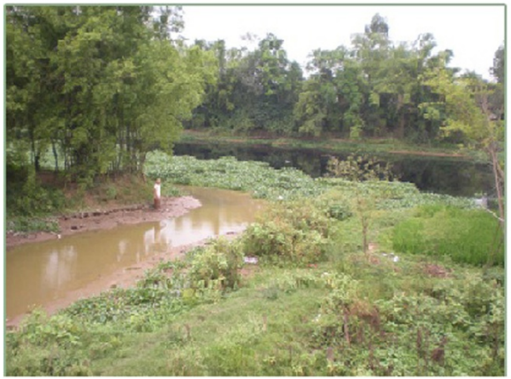
Figure 2 Open drainage system (top) and Nhue River containing untreated wastewater flowing from Hanoi (bottom) in Hoang Tay Commune, Kim Bang District, Hà Nam Province, North Vietnam. Photo: Vi Nguyen, 2010.

and that multiple disciplines and research questions examining the different aspects of the issue attempted to address its complexity.